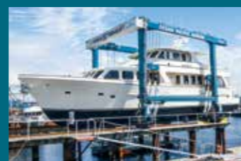
100 BFMII - British Columbia, Canada