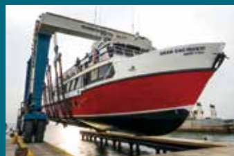
300 CII - Cumaná, Venezuela

Please visit marinetraavelift.com for a complete and current list of available features and options for each C-Series mobile boat hoist.