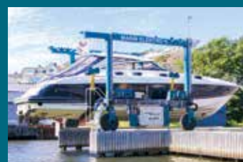
35 BFMII - Gressvik, Norway

Please visit marinetraavelift.com for a complete and current list of available features and options for each BFMII Series mobile boat hoist.