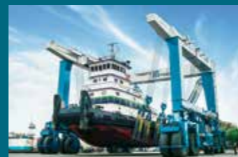
1000 C - Virginia, USA