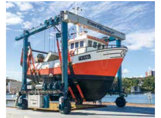
75 BFMII - Sandefjord, Norway