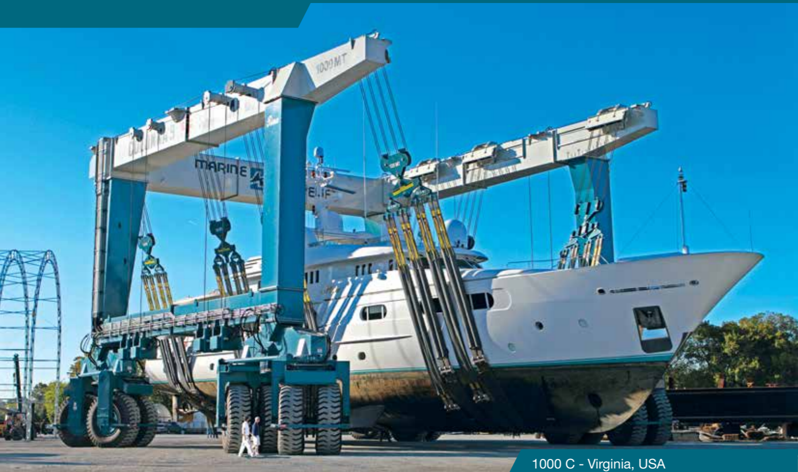
1000 C - Virginia, USA

It takes integrity and performance to build a reputation of reliability.