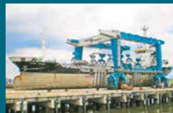
700 C - Perak Darul Ridzuan, Malaysia