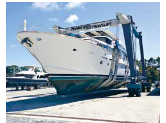
150 CII - Alabama, USA