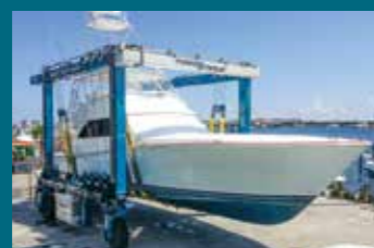
50 BFMII - Florida, USA